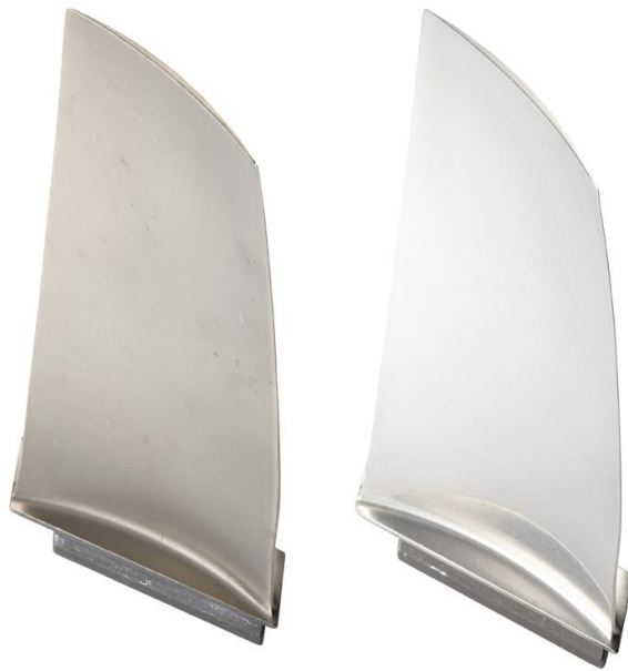
A turbine blade pre- and post-processing

One of the most crucial components of a working engine system is its engine blades, such as turbine or compressor blades. A turbofan engine, for example, has many parts: at the front, the fan draws in the air and directs it into the compressor, which is composed of several blades arranged in a row and decreasing in size towards the end of a narrowing tube. Using a rotational movement, the suction air is compressed to up to a thirtieth of its volume, which in turns compresses and heats the gas. The air is then fed into the combustion chamber where it is mixed with injected kerosene and burned. The resulting energy propels the high-pressure turbine where the turbine blades driving the compressor are installed. The downstream low-pressure turbine is also set in motion using this energy. The low-pressure turbine consists of longer turbine blades and is directly connected to the fan. The turbine ensures that the fan rotates. The fan not only sucks the air into the interior, but past the compressor and the turbine. The cold air, which is fed past the interior, generates the greatest propulsive force. The process inside the engine merely ensures that the engine remains running. So the exhaust gas flow produces 20% of the propulsion and the fan, 80%. Both the turbines and compressor blades are subject to high temperatures and pressures. Manufacturers have therefore implemented strict regulations for the production and processing methods used.