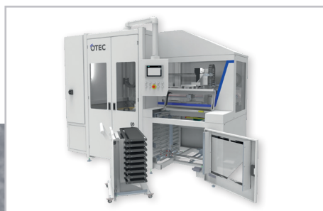
Trolley for loading up to 9 pallets at once