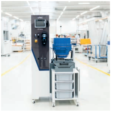
CF-Standard with one container