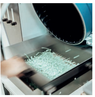
Reliable separation of workpieces