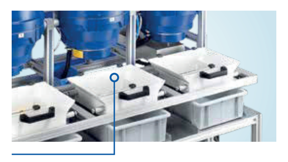
System for storing additional plastic containers for media