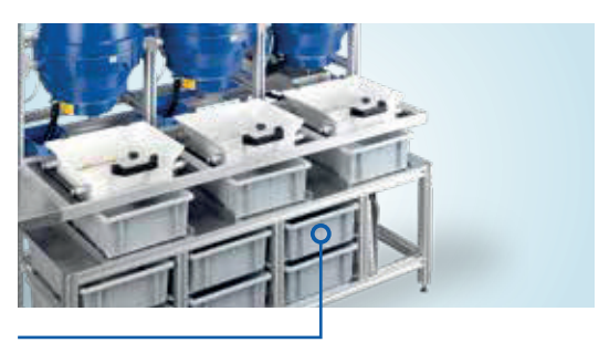
Manual separating unit using manual screen