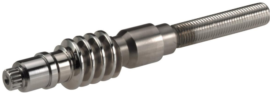
Fig. 4: Worm gear shaft (OTEC)