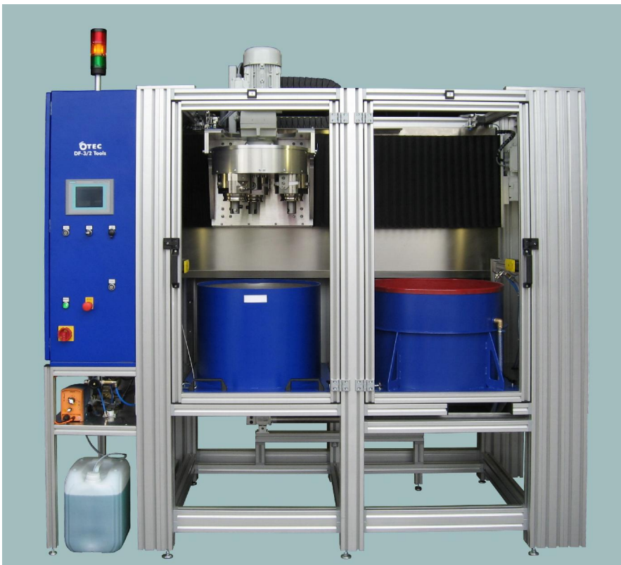
Fig. 1: DF-3 S2 drag finishing unit

The new DF-3 S2 two-stage drag finishing machine from OTEC represents a totally new innovation. . For the first time , this machine makes it possible to grind and polish workpieces such as implants and watch cases with only a single clamping operation. The sophisticated technology achieves the quality of manual polishing combined with the reliability of an automated process.