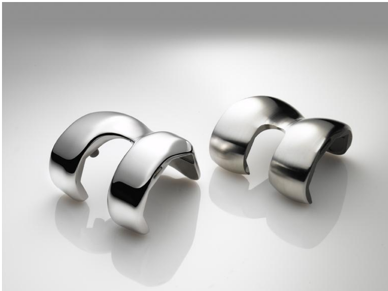
Fig. 3: Knee joints (OTEC)

After finishing, these particularly demanding workpieces must have absolutely smooth and scratch-free surfaces. For this application, the DF-3 S2 from OTEC is ideal. For example, the initial surface roughness of chromium cobalt or titanium knee joints after milling can be between Ra 1.0 \mu\text{m} and 2.0 \mu\text{m} . In the first stage, the workpieces are smoothed to a Ra value of about 0.06 \mu\text{m} by means of special abrasive media. This process can take from 2 to 4 hours. In the second stage, a new high-quality polishing granulate is used to polish up to 9 knee joints (in the larger machines correspondingly more) to a brilliant finish and a Ra value of approx 0.01 \mu\text{m} in only half an hour. This gives a completely scratch-free surface which satisfies the most stringent requirements.