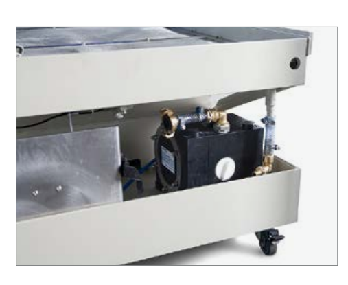
Using a fork lift to change containers Pump unit similar to that of SF machine