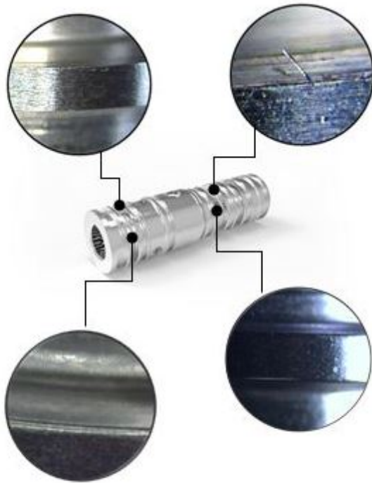
Before (up) and after (down) processing

Stream finishing (SF) + Pulse finishing = Superb surface quality in minimal time