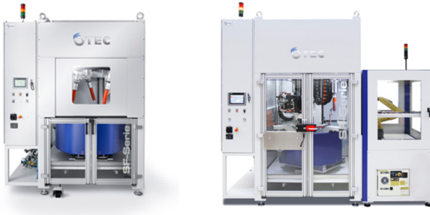
SF MANUAL Series (left) and SF AUTOMATIC Series (right) – with optional PULSFINISH

OTEC stream finishing systems are cost-effective, process-oriented solutions that combine easy automation with maximum process reliability.