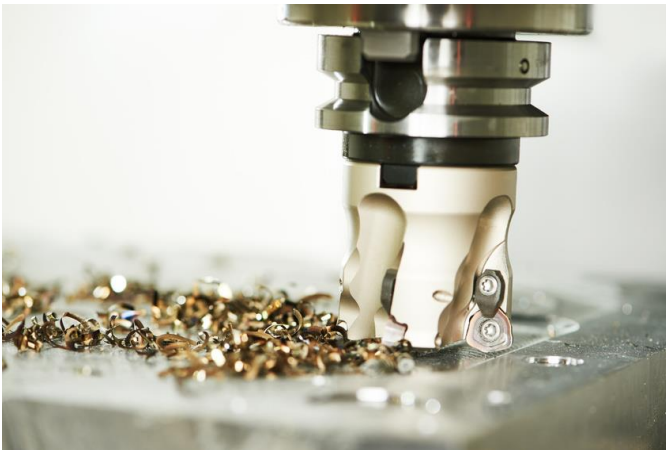
Cutter body during cutting

Cutter bodies such as drilling, milling and rotary bodies are used for machining processes and serve as holders for inserts. Cutting inserts are either screwed or soldered onto the cutter bodies. Cutter bodies are available in different lengths and shapes. Manufactured of hardenable steel