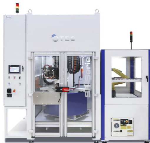
Stream finishing machine SF 3 Automation

Because it is much faster than conventional methods, the OTEC process delivers considerable cost benefits. The processing forces involved can be very great and enable extremely fine surfaces to be obtained, even in small grooves or flutes. For companies manufacturing items in large quantities, the stream finishing units can be equipped with suitable automation systems.