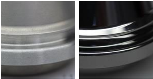
Forming surfaces of the can seamers before and after OTEC finishing

Because it is much faster than conventional methods, the OTEC process delivers considerable cost benefits. The processing forces involved can be very great and enable extremely fine surfaces to be obtained, even in small grooves or flutes. For companies manufacturing items in large quantities, the stream finishing units can be equipped with suitable automation systems.