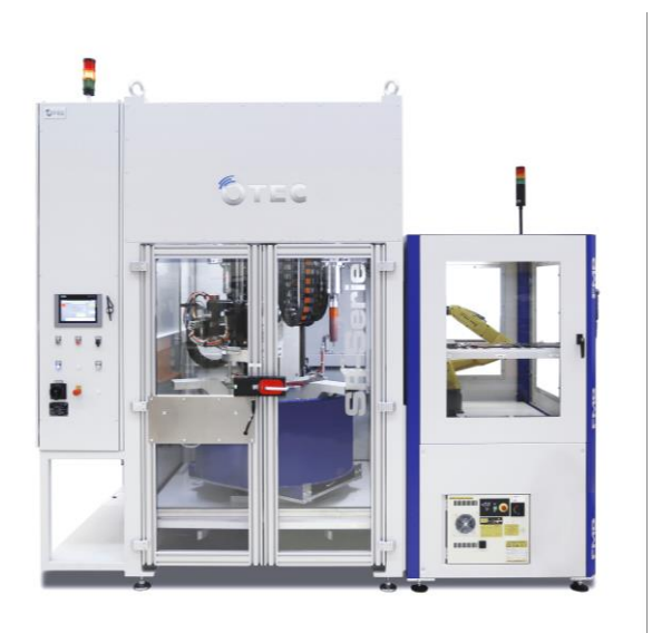
Stream finishing machine SF 3 Automation

Because it is much faster than conventional methods, the OTEC process delivers considerable cost benefits. The processing forces involved can be very great and enable extremely fine surfaces to be obtained, even in small grooves or flutes. For companies manufacturing items in large quantities, the stream finishing units can be equipped with suitable automation systems.