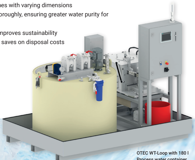
OTEC WT-Loop with 180 l Process water container