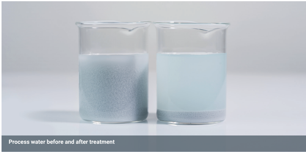
Process water before and after treatment