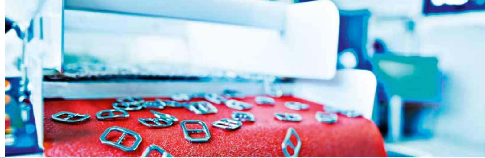
CF oil series

The CF machines from OTEC work on the disc finishing principle, an extremely efficient mass finishing process. During this process, the workpieces are immersed in a rotating grinding or polishing granulate in an open, barrel-shaped process container. The medium is rotated by means of a rotating disc which forms the bottom of the container and which is separated from the container wall by an adjustable gap.