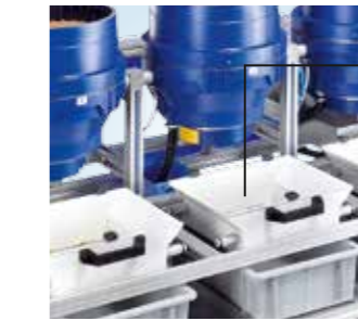
System for storing additional plastic containers for media