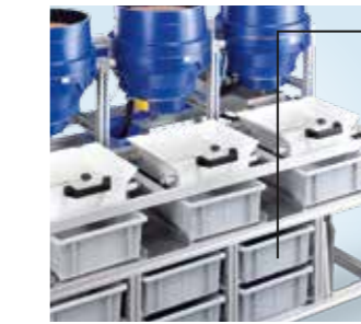
Manual separating unit using manual screen