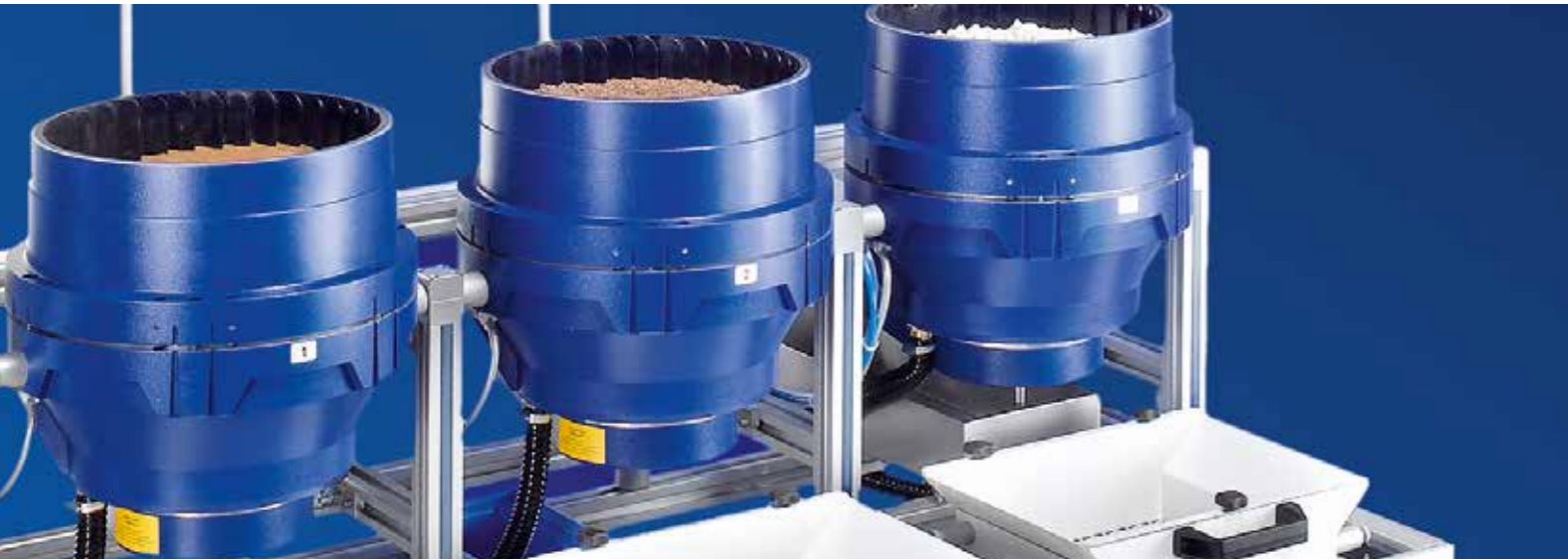
Sophisticated and reliable

A processing system which is fine tuned to each specific application sets the standards for efficient and economical deburring, grinding, burnishing and polishing. The CF Series of machines is a modular concept which can easily be extended. For example, up to six process containers can be set up next to one another in a single unit.